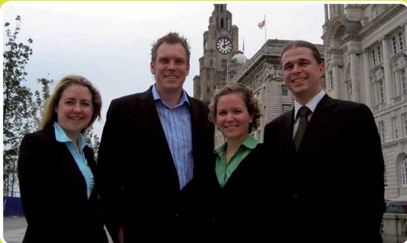
Pulse Regeneration Team

Pulse Regeneration has been commissioned by a number of key partners including Copeland Homes, Copeland Borough Council, Cumbria Police, and the South Whitehaven Neighbourhood Management Board to test if there is a need for a Neighbourhood Centre that would provide services to local people living in South Whitehaven.